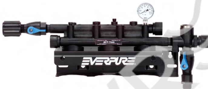
QC71 Triple Parallel Head: EV9272-23

Engineered for durability, strength and longevity. Will not corrode